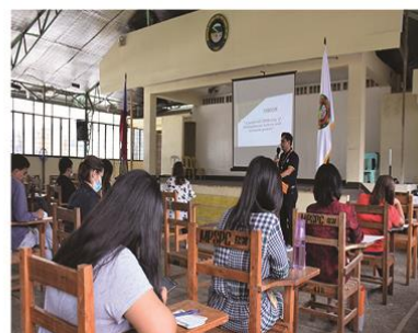
Newly hired personnel from both campuses underwent an orientation at the MPSPC Auditorium last November 6, 2020.

Magna Carta of Women and Commission on Higher Education (CHED) Memorandum Order No. 1, Series of 2015, in which all government agencies and instrumentalities shall promote empowerment of women and pursue equal opportunities for women and men and ensue equal access to resources and to develop results and outcome, the GAD unit discussed issues related to these laws.