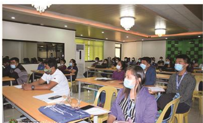
The Teacher Education Department, IT Department and the Management Information System conducted a collaborative workshop for the Vicariate Schools of Mountain Province on developing instructional videos.