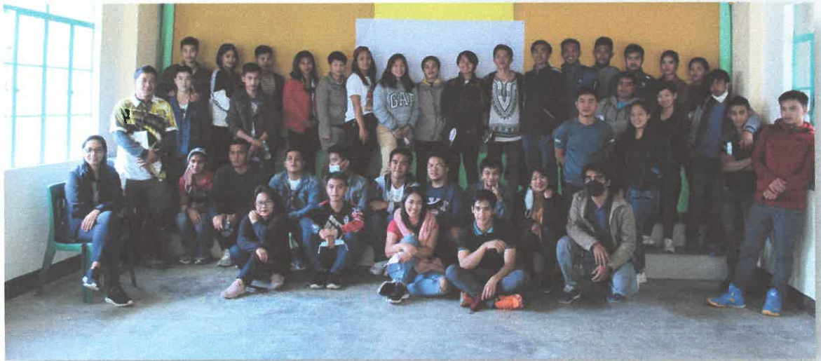
Group pictorial of the facilitators along the students who participated in this activity