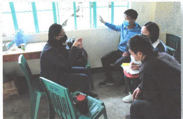
Ma'am Kaplaan discussing and answering the students questions regarding the Subject Forensic Photography.