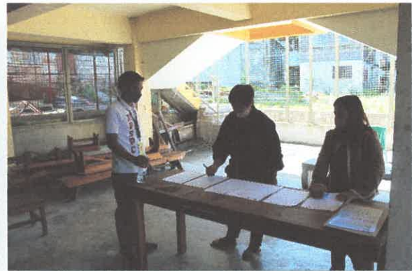
The Faculty Members, College Students, Parents of Senior High Students and SK Members registering for day one of the program.