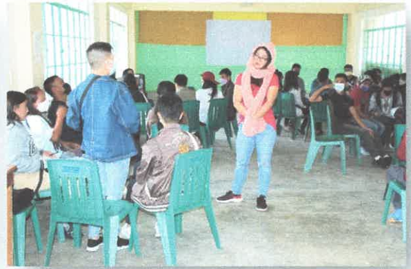
Ma'am Ullalim discussing and answering the students questions regarding the Subject Comparative Models of Policing.