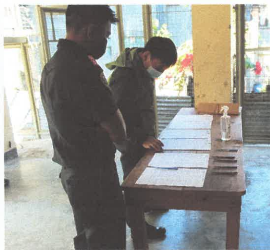
The Faculty members and students registering for the 2 nd day of the activity