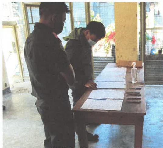
The Faculty members and students registering for the 2 nd day of the activity