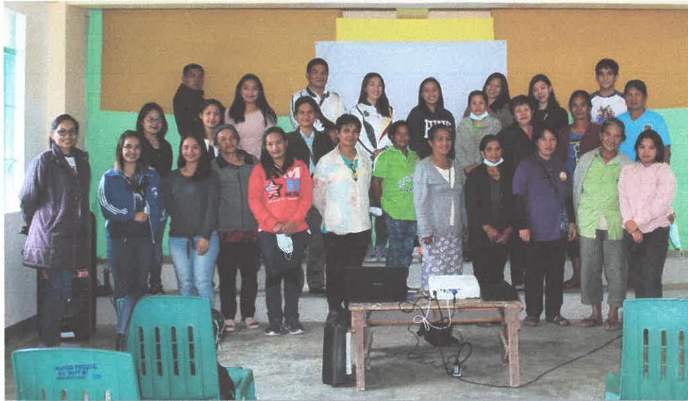
The Faculty members, SK members and Parents taking a pictorial at the end of day one of the program