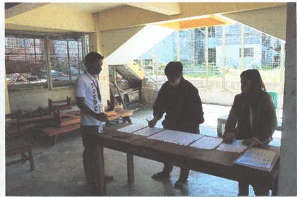
The Faculty Members, College Students, Parents of Senior High Students and SK Members registering for day one of the program.