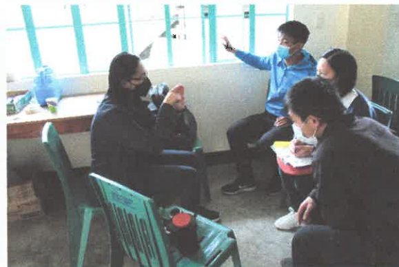
Ma'am Kaplaan discussing and answering the students questions regarding the Subject Forensic Photography.