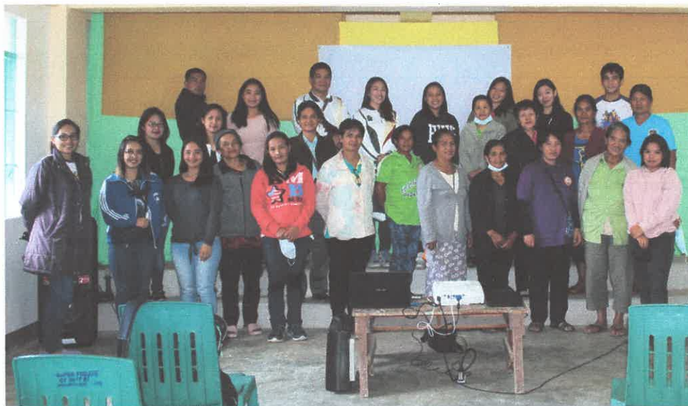
The Faculty members, SK members and Parents taking a pictorial at the end of day one of the program