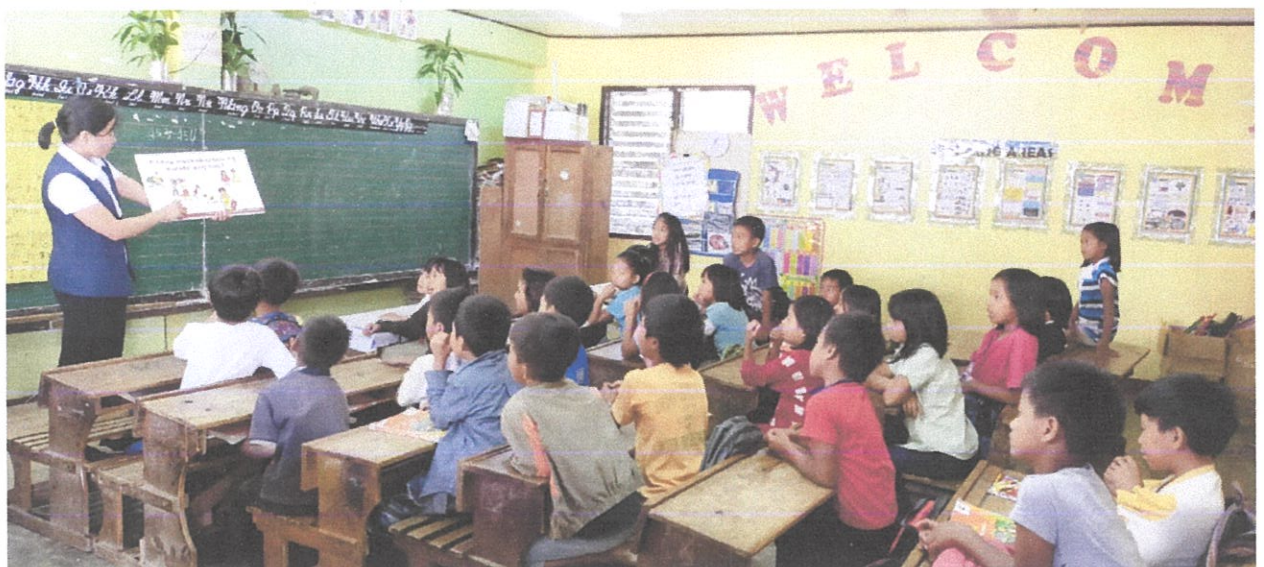
Lecture to elementary pupils.