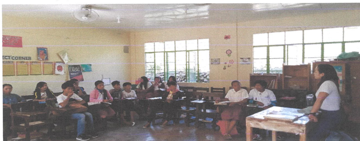
Lecture on reproductive health