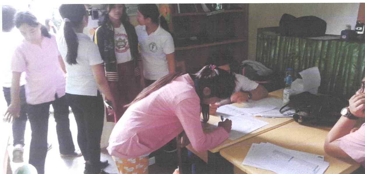
Students filling up the attendance form