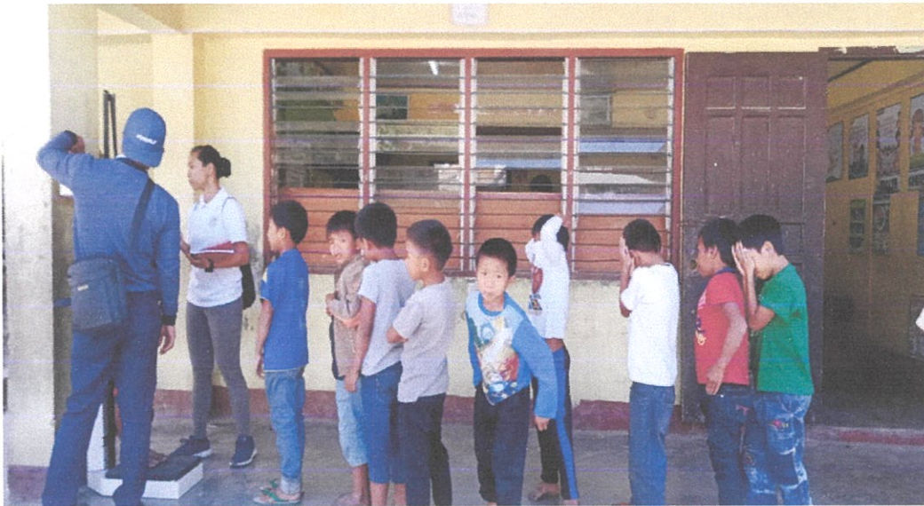
Height and weight taking