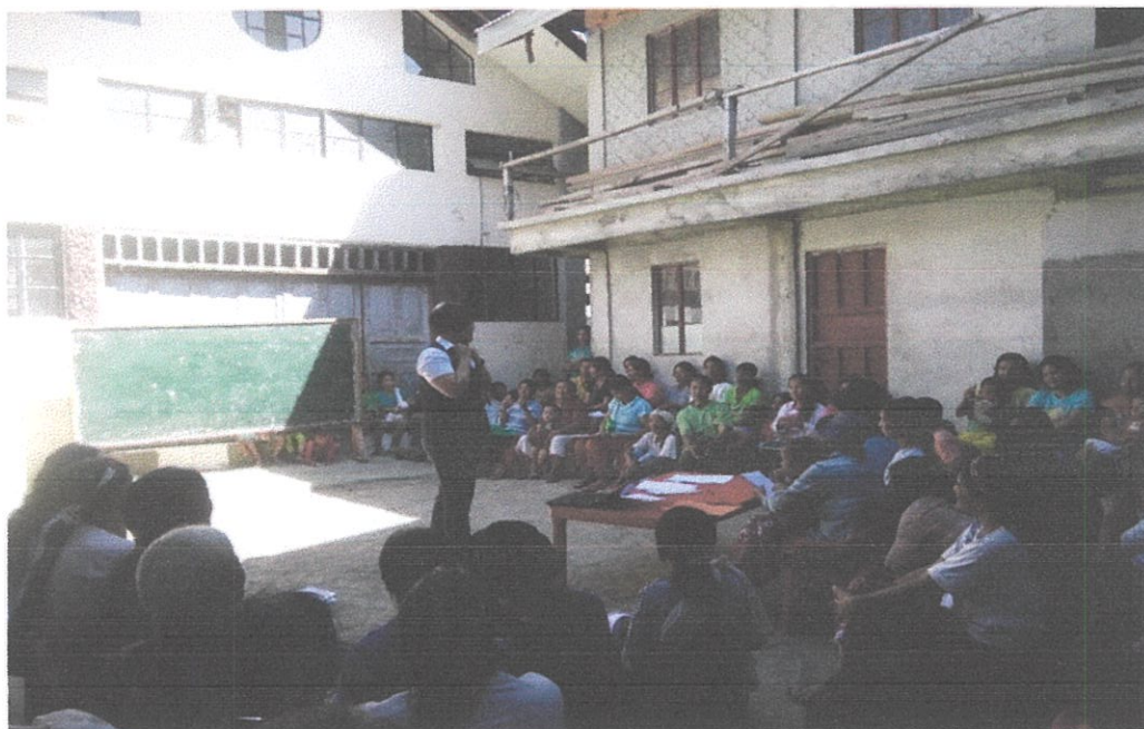
Queries were entertained and explained to the community