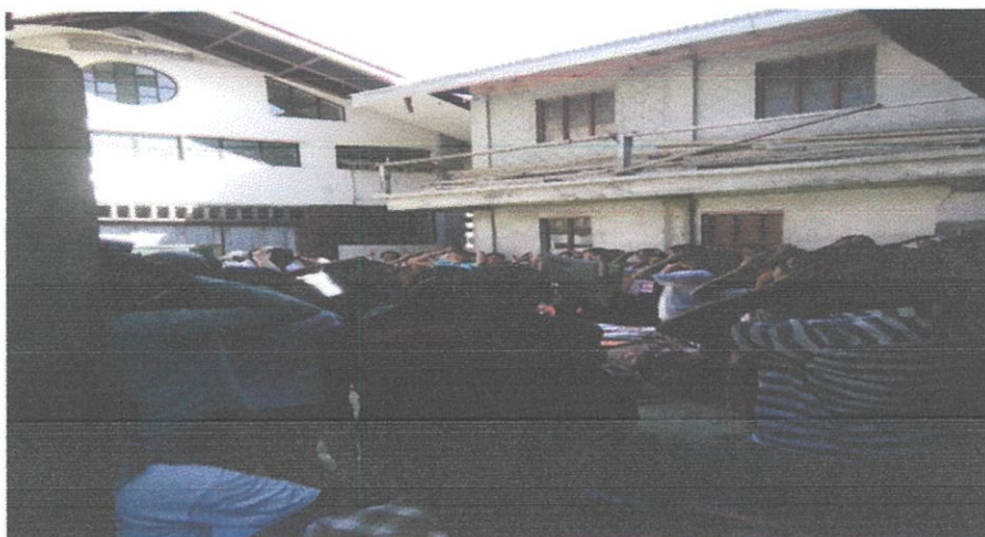
Community action song before the health teaching session

The participants requested for herbal medicine preparation lectures and trainings when they were asked at the end of the session asked what other lectures do they need that can be beneficial for them.