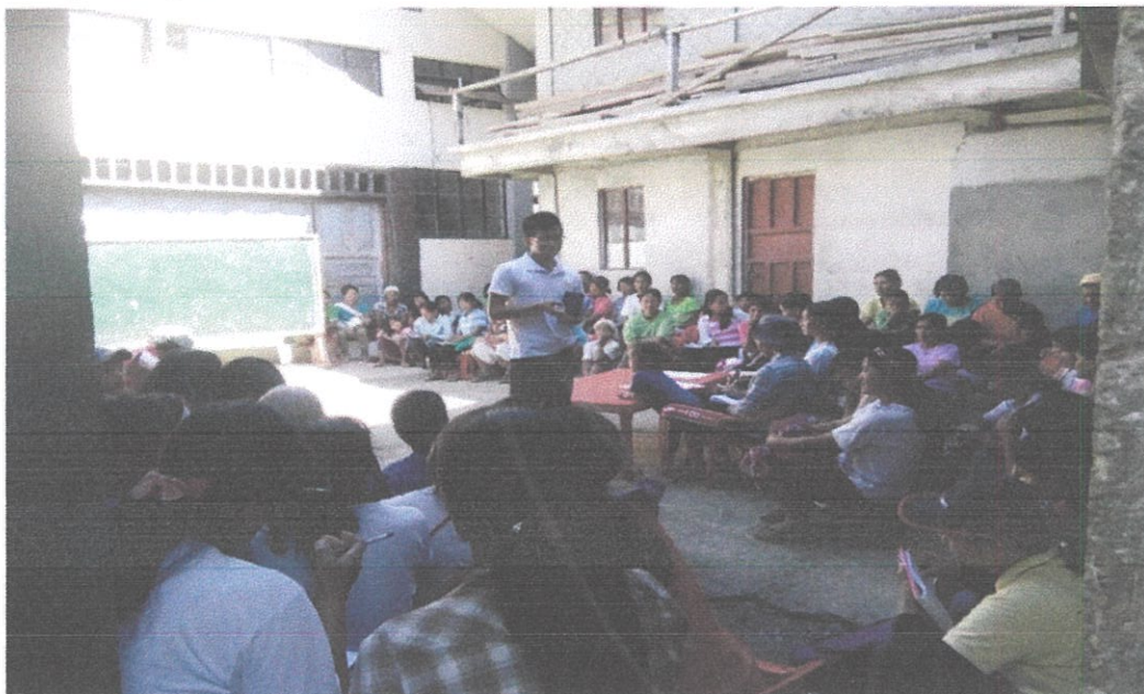
Lecture on wound care and proper hand washing

The participants from different sitios of Betwagan listening attentively.