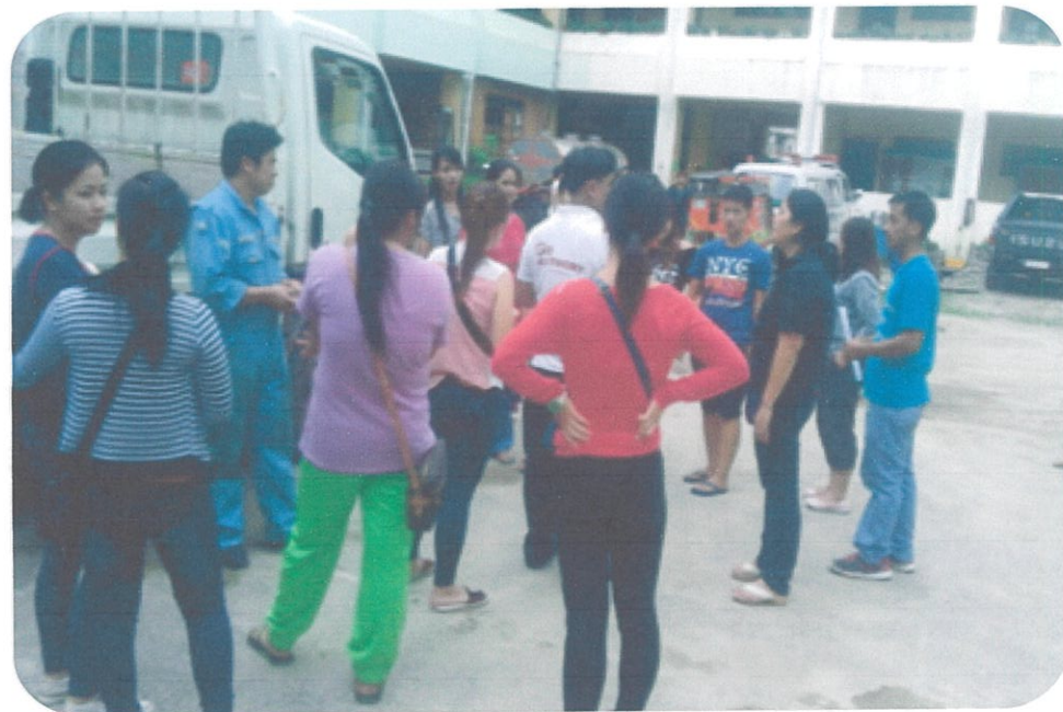
Collection of materials