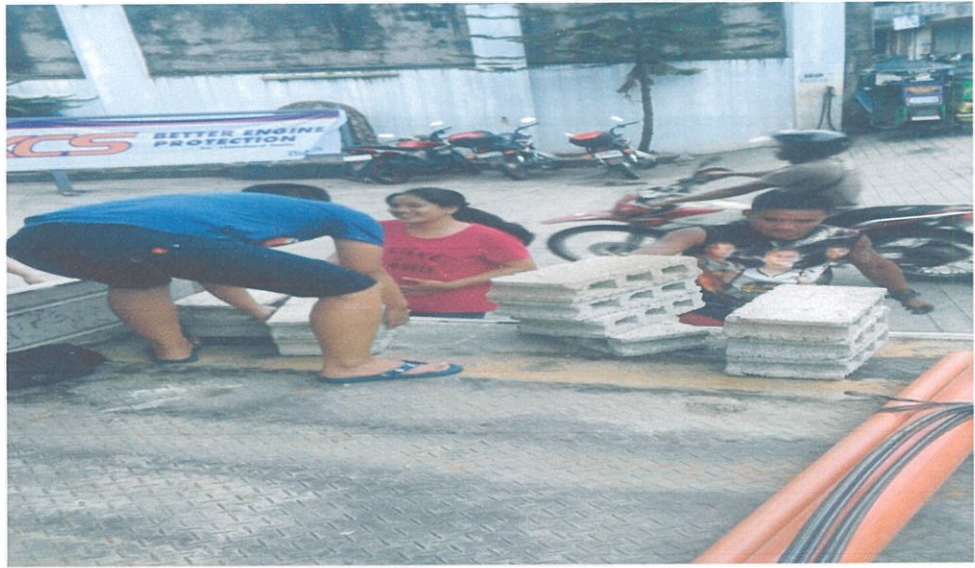
@ Talubin Waiting Shed